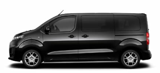
PERLA NERA BLACK (M)