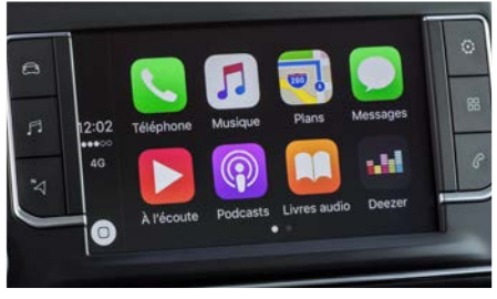
MY CITROËN PLAY

* Available as an option or standard on selected versions. (1) Only information from partners can be displayed. (2) Depending on smartphone model. Additional terms and conditions apply on connected services, including customer acceptance of location sharing prior to activation.