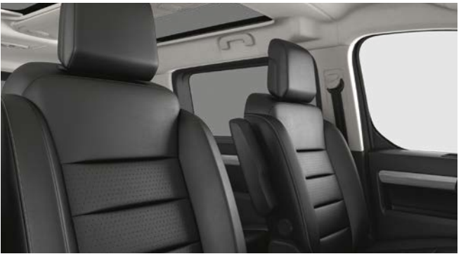
BLACK 'CLAUDIA' LEATHER TRIM<sup>(1)</sup> (Standard on Flair)