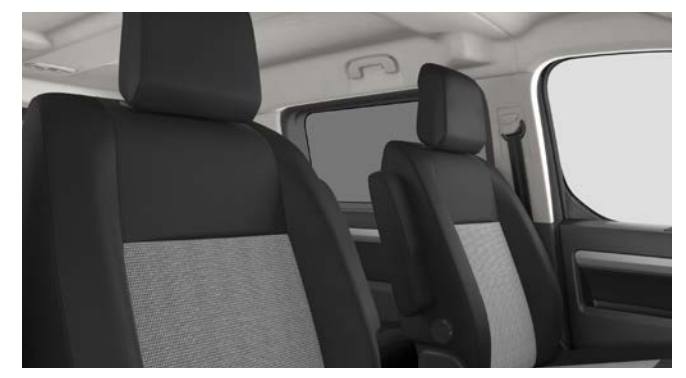
GREY 'MICA' CLOTH TRIM<sup>(1)</sup> (Standard on Business and Business Edition)