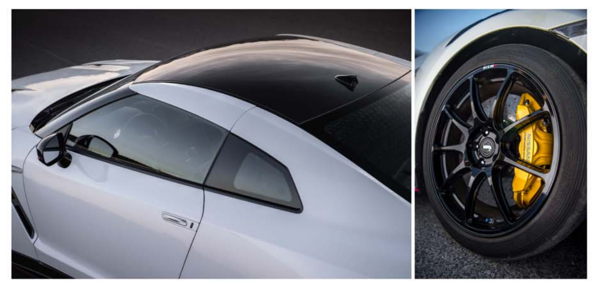
Image shows 2020 Track Edition with optional Storm White paint (£875), optional Carbon Roof (£2,000) and optional Carbon Ceramic Brakes (£7,500).