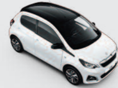
Diamond White / Raven Black