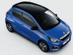
Calvi Blue / Raven Black