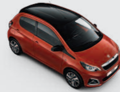
Antelope Red / Raven Black

The PEUGEOT 108 is available in a choice of 8 body colours, with the Allure version taking a Raven Black roof and door mirrors.