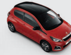
Laser Red / Raven Black