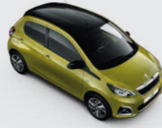
Green Fizz / Raven Black