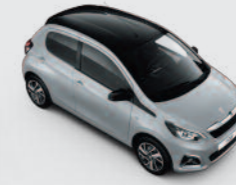
Zircon Grey / Raven Black