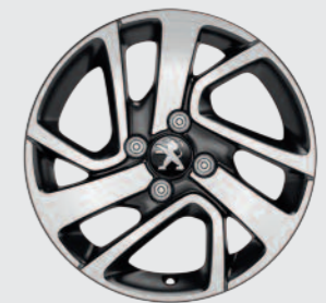
15" 'Thorren' Alloys