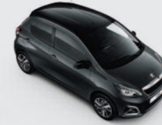
Carbon Grey / Raven Black