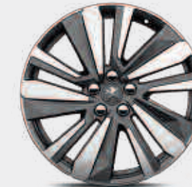
19" 'WASHINGTON' Two-tone diamond-cut alloy wheels (optional on Allure versions)