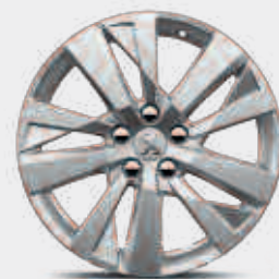
17" 'CHICAGO' alloy (standard on Active versions)

*Optional on Active versions **Optional on Allure versions