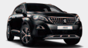
Nero Black** (Met)