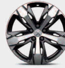
18" 'LOS ANGELES' Two-tone diamond-cut alloy wheels** (linked to Advanced Grip Control®)