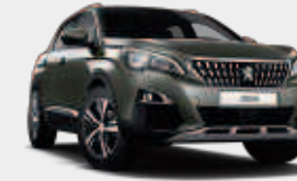
Amazonite Grey** (Met)