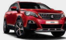
Ultimate Red** (Special)