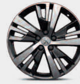
18" 'DETROIT' Two-tone diamond-cut alloy wheels* (standard on Allure versions)