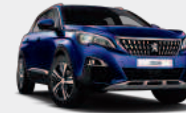
Magnetic Blue** (Met)