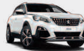
Bianca White** (Solid)