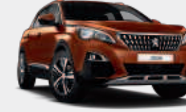
Sunset Copper** (Met)