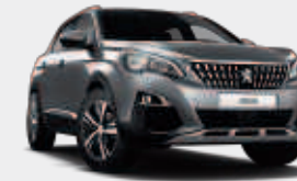
Cumulus Grey** (Met)