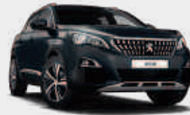
Hurricane Grey* (Solid)