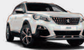
Pearl White** (Pearlescent)