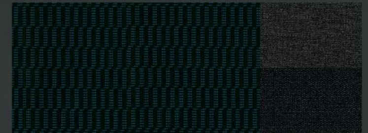
Grey and dark blue "Ocean" cloth trim, on Active Level