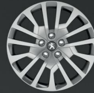
17 inch 'Miami' wheel trims