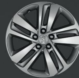
17 inch 'Phoenix' alloy wheels